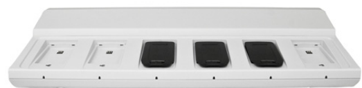
CR4 for d81